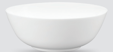
SERVING BOWL 205 mm • 1.63 L